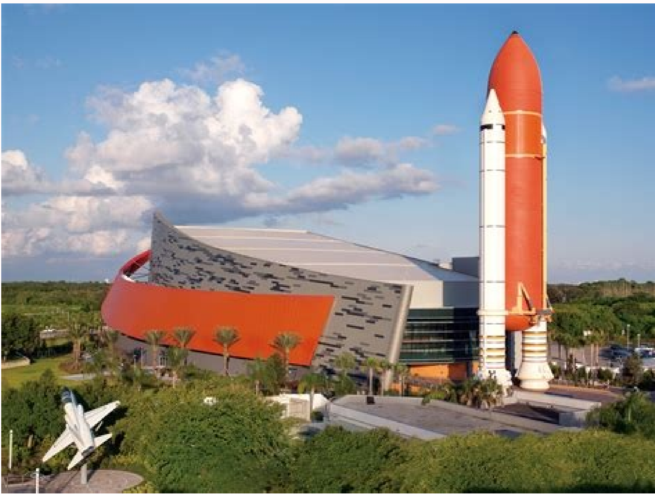
Kennedy space center visitor complex.